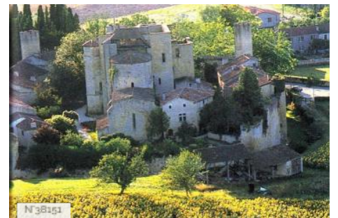
Village - Larressingle