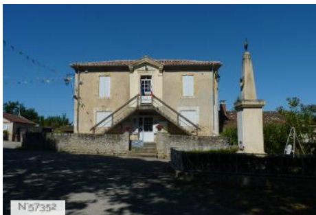
City hall - Larressingle