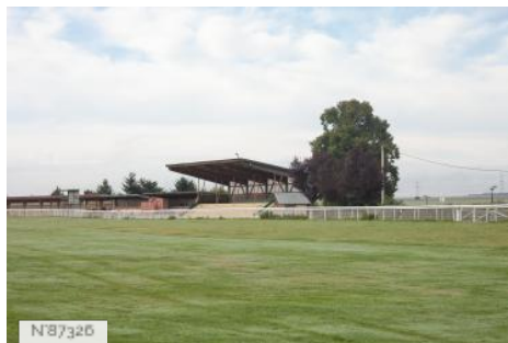
Hippodrome sports complex