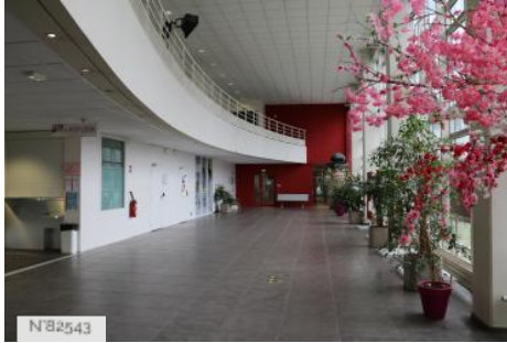
City of Cergy - Les Gémeaux building - City Hall - Hall