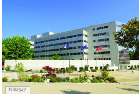
City of Cergy - Gémeaux building - City Hall - Exterior square