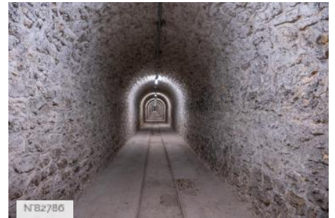
Fort de Saint-Cyr - Tunnel