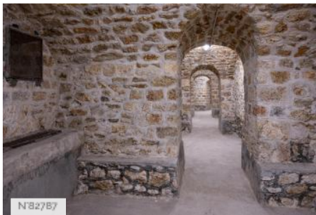
Fort de Saint-Cyr - Cells