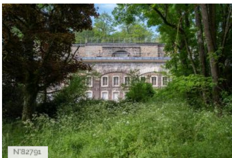
Fort de Saint-Cyr - Exterior