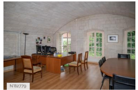
Fort de Saint-Cyr - Offices