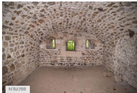
Fort de Saint-Cyr - Fire station room