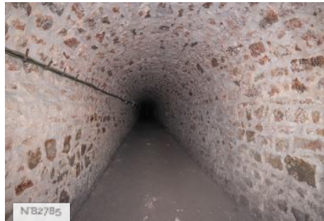
Fort de Saint-Cyr - Stone corridors