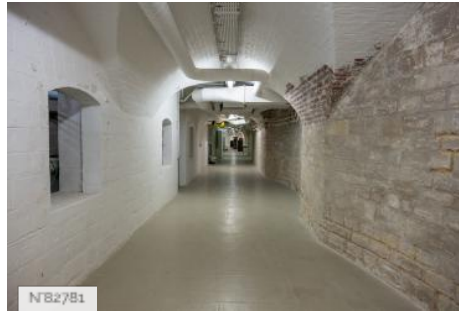
Fort de Saint-Cyr - Interior circulation