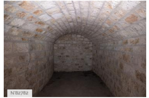
Fort de Saint-Cyr - Dungeons