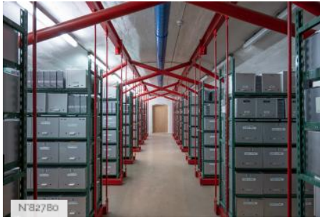
Fort de Saint-Cyr - Archive Stores