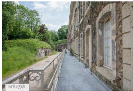
Fort de Saint-Cyr - Balcony