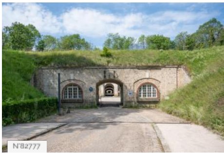
Fort de Saint-Cyr - Main entrance