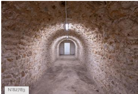
Fort de Saint-Cyr - Arched rooms