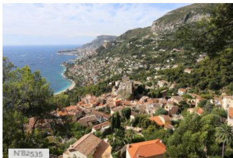
Ruelles du village médiéval de Roquebrune-Cap-Martin