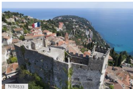
Le Château Médiéval de Roquebrune