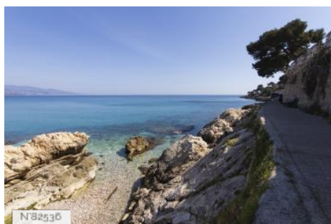
Promenade Le Corbusier