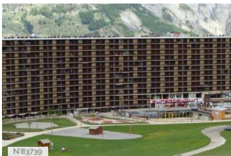
Residence Superdevoluy Bois d'Aurouze