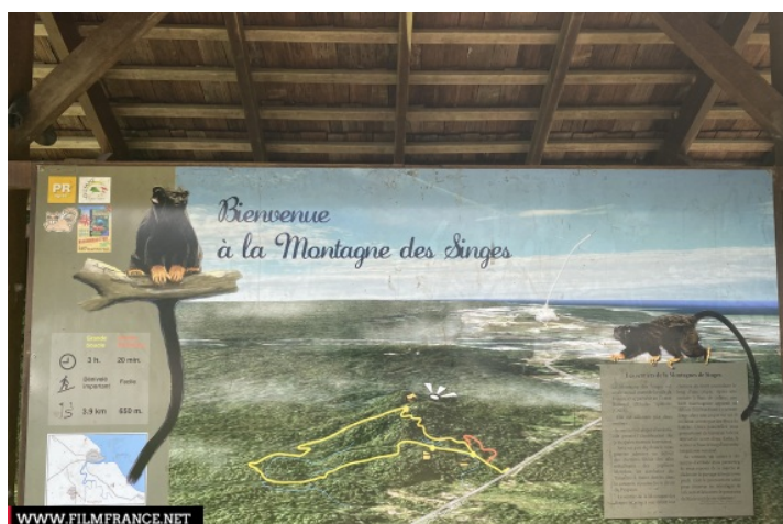
Caption: La Montagne des singes à Kourou - Guyane

Contact the commission French Guiana Film Commission ✉ | 📞 +594 694 42 70 11