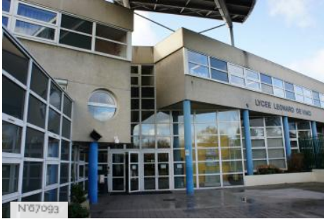
City of Saint-Witz - Leonardo da Vinci highschool/Global information