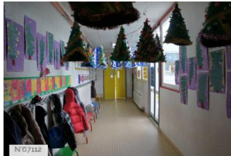
City of Saint-Witz - Jeanne du Chesne school