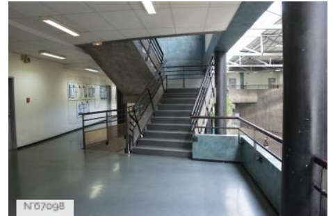
City of Saint-Witz - Leonardo da Vinci highschool/Room A23