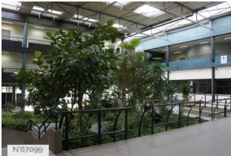
City of Saint-Witz - Leonardo da Vinci highschool/hall