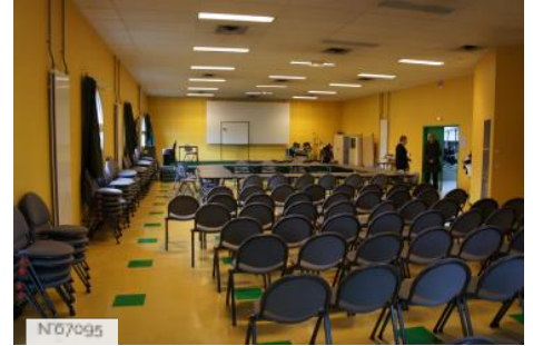
City of Saint-Witz - Leonardo da Vinci highschool/Function room