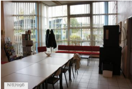
City of Saint-Witz - Leonardo da Vinci highschool/Teachers room