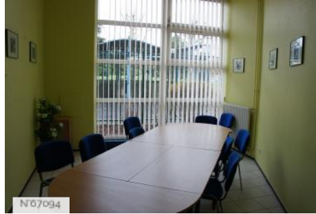
City of Saint-Witz - Leonardo da Vinci highschool/Principal's office