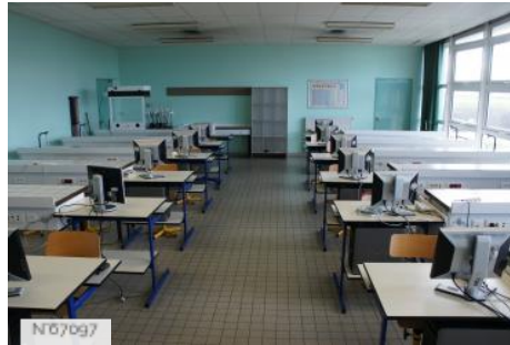
City of Saint-Witz - Leonardo da Vinci highschool/Chemistry room