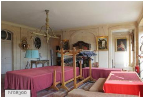
Château de Champlâtreux - Lounge and corridor