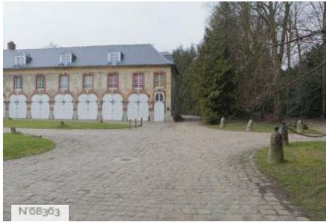
Château de Champlâtreux - Exteriors