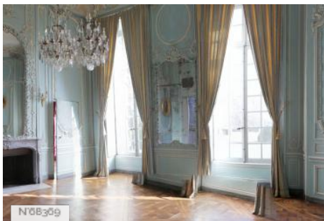
Château de Champlâtreux - Blue room