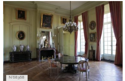
Château de Champlâtreux - Duke hall