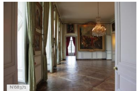
Château de Champlâtreux - Billiard room