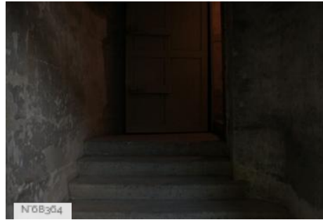
Château de Champlâtreux - Undergrounds