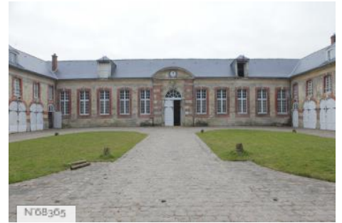
Château de Champlâtreux - Stables