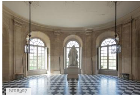
Château de Champlâtreux - Global information