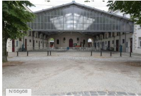
Alfort Veterinary School - Stables