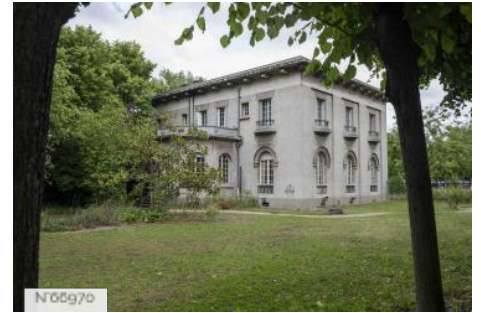
Alfort Veterinary School - Director's pavilion