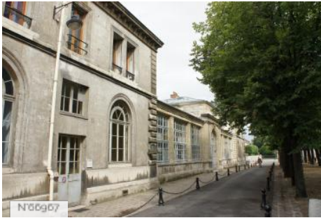
Alfort Veterinary School - Exteriors