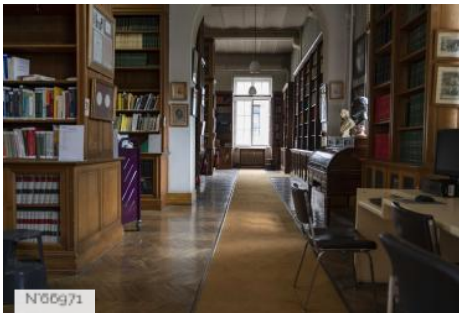
Alfort Veterinary School - Library