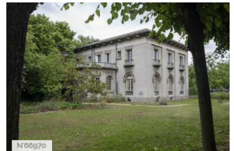
Alfort Veterinary School - Director's pavilion