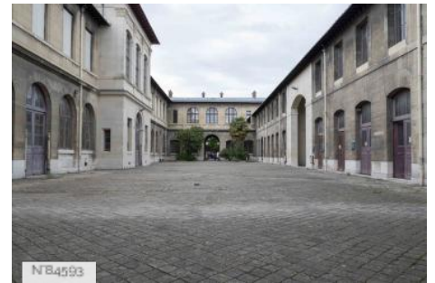
Ecole Nationale Vétérinaire d'Alfort - Paved courtyard