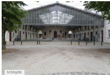
Alfort Veterinary School - Stables