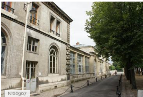
Alfort Veterinary School - Exteriors