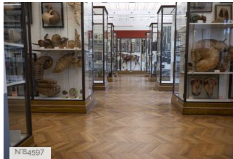
Ecole Nationale Vétérinaire d'Alfort - Fragonard Anatomy Museum