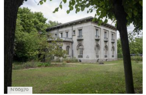
Alfort Veterinary School - Director's pavilion