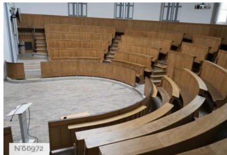
Alfort Veterinary School - Lecture theater