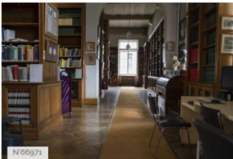
Alfort Veterinary School - Library