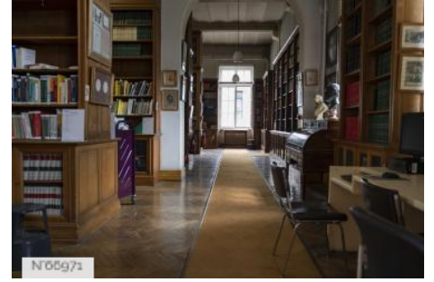
Alfort Veterinary School - Library