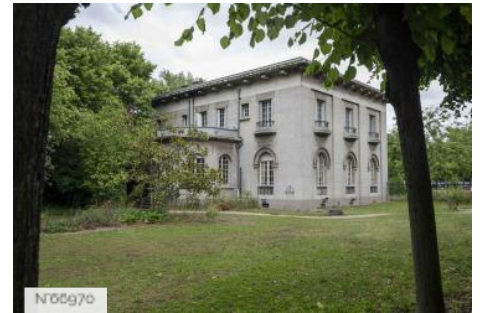
Alfort Veterinary School - Director's pavilion