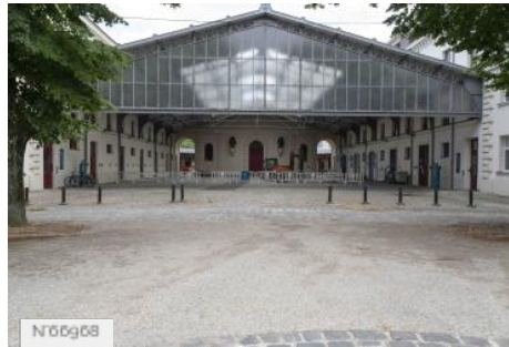
Alfort Veterinary School - Stables