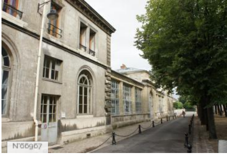
Alfort Veterinary School - Exteriors