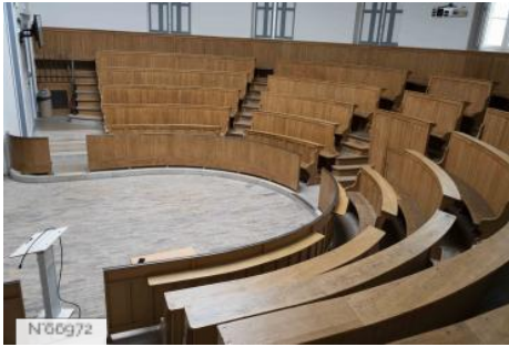
Alfort Veterinary School - Lecture theater