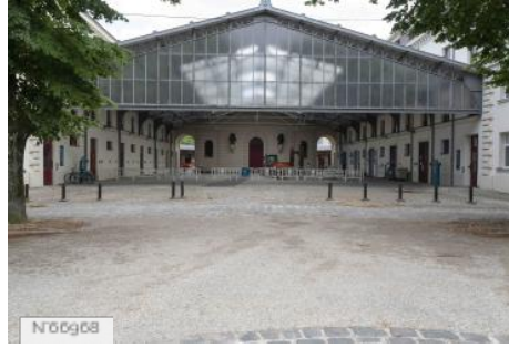
Alfort Veterinary School - Stables