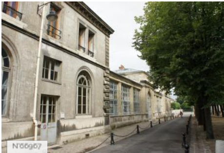
Alfort Veterinary School - Exteriors