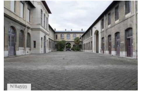
Ecole Nationale Vétérinaire d'Alfort - Paved courtyard