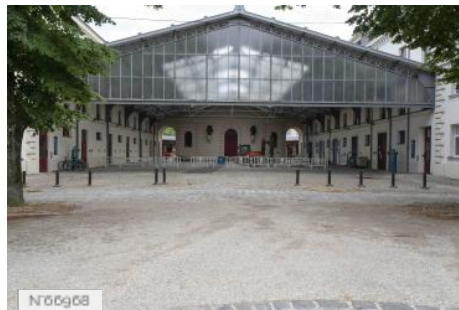
Alfort Veterinary School - Stables