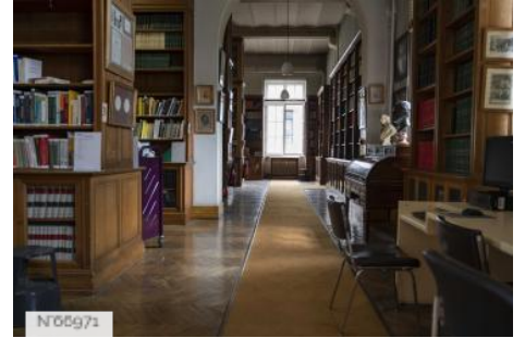
Alfort Veterinary School - Library