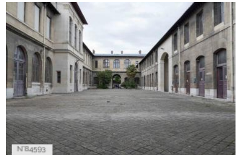
Ecole Nationale Vétérinaire d'Alfort - Paved courtyard