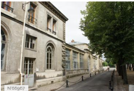
Alfort Veterinary School - Exteriors