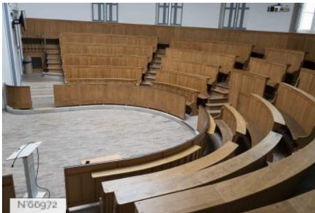
Alfort Veterinary School - Lecture theater