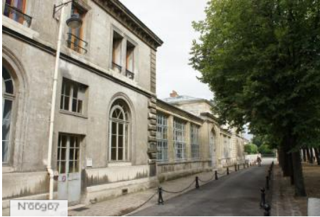
Alfort Veterinary School - Exteriors