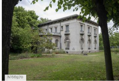
Alfort Veterinary School - Director's pavilion