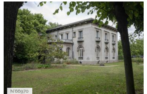
Alfort Veterinary School - Director's pavilion