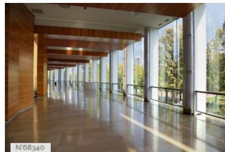
La Maison de la radio - Seine Gallery