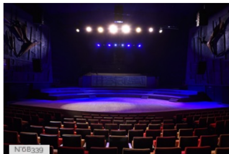
La Maison de la radio - The Studio 104