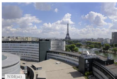
La Maison de la Radio- Global index