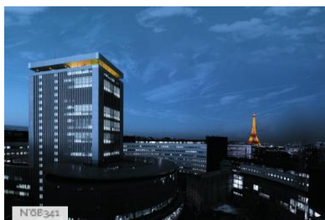
La Maison de la radio - Office with a panoramic room