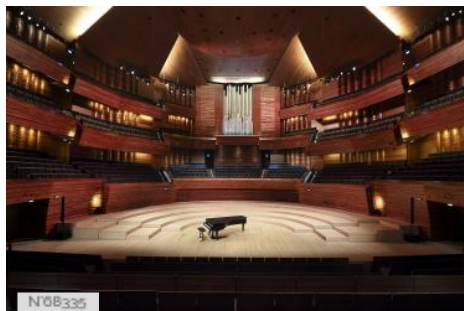
La Maison de la radio - Auditorium