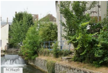
City of Nemours - Perthuis Island