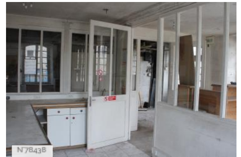
City of Nemours - Mill of Nemours