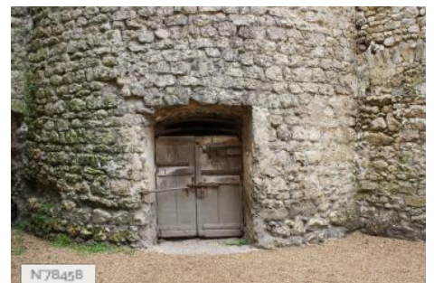
City of Nemours - Château Musée de Nemours - Dungeon