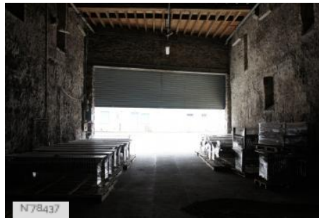
City of Nemours - Tithe Barn