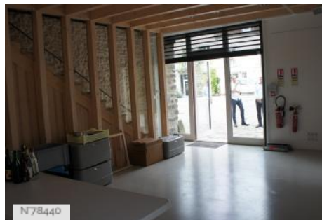
City of Nemours - Château Musée de Nemours - Concierger's lodge & Function room