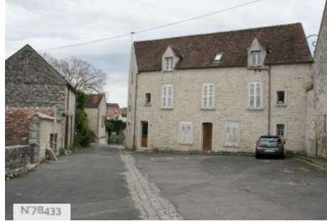
City of Nemours - Château Musée de Nemours - Outer Courtyard