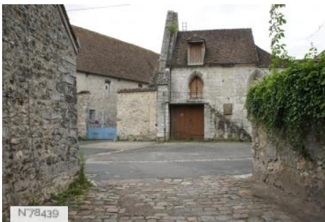
City of Nemours - Wash house and Moats