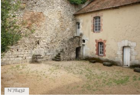
City of Nemours - Pistol Courtyard