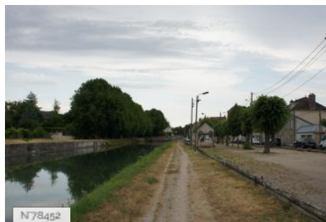
City of Nemours - Global description