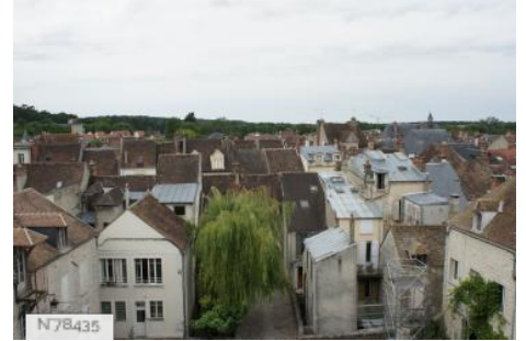
City of Nemours - Château Musée de Nemours - Global description