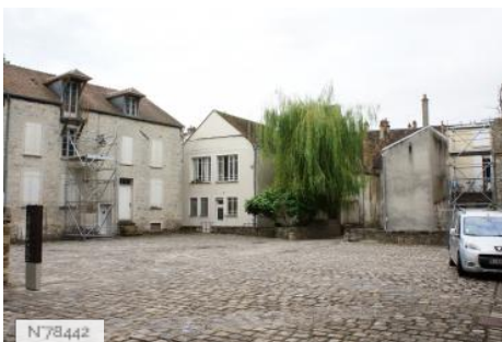
City of Nemours - Château Musée de Nemours - Courtyard of Honor