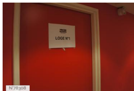
Les Trois Baudets - Dressing rooms