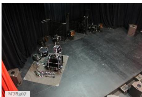
Les Trois Baudets - Concert Hall