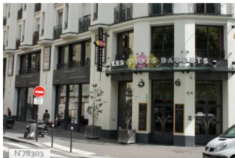
Les Trois Baudets - Global information