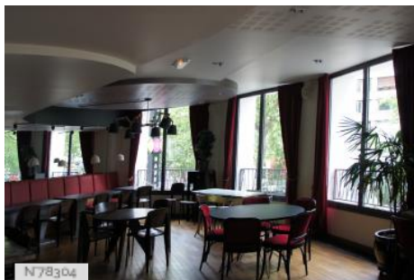
Les Trois Baudets - Restaurant