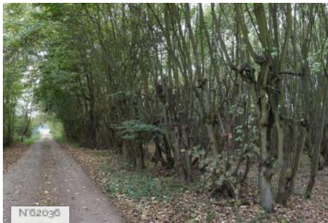
Military Fort of Marly - Around the fort