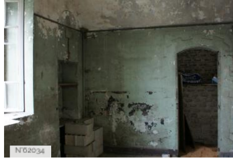
Military Fort of Marly - Troops barrack buildings