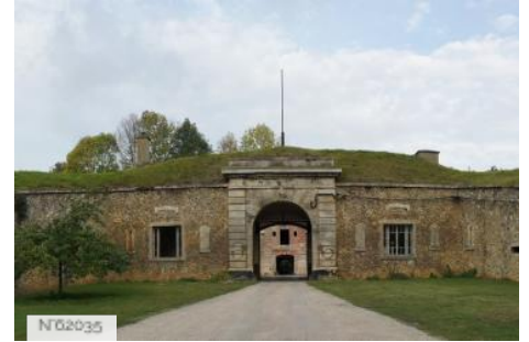
Military Fort of Marly - Exteriors