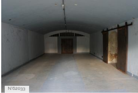
Military Fort of Marly - Officers barrack buildings