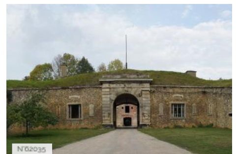
Military Fort of Marly - Troops barrack buildings