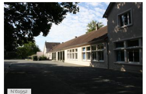
Jouy-en-Josas city - Bourget-Calmette primary school