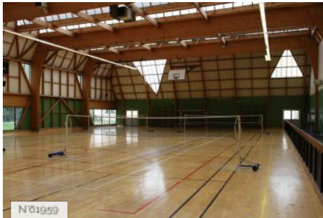
Jouy-en-Josas city - Domaine de la Cour Roland/Gymnasium