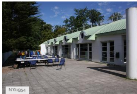
Jouy-en-Josas city - Leisure centre