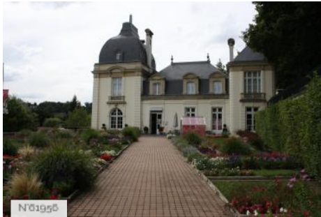
Jouy-en-Josas city - Toile de Jouy museum