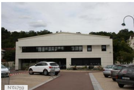
Jouy-en-Josas city - Vieux marché hall