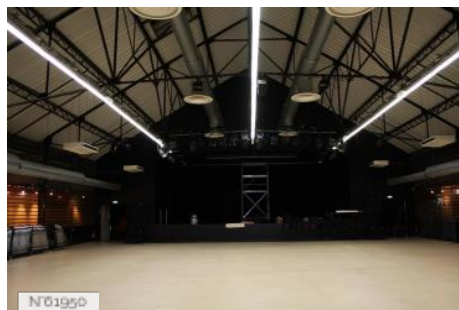
Jouy-en-Josas city - Global information