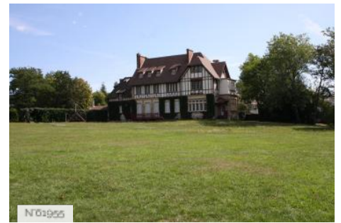
Jouy-en-Josas city - Jeanne Blum school