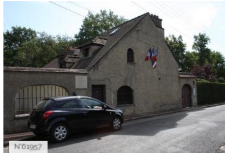
Jouy-en-Josas city - Jeanne and Léon Blum house