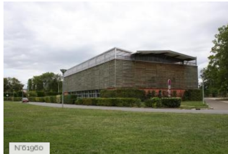
Jouy-en-Josas city - Domaine de la Cour Roland/Covered tennis courts