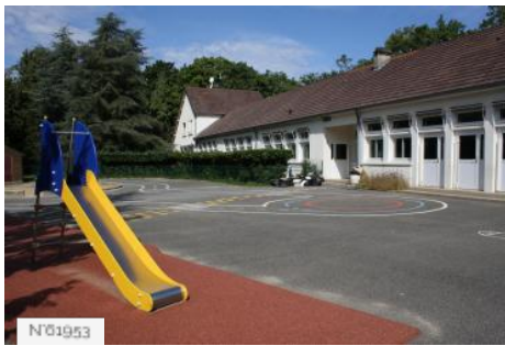
Jouy-en-Josas city - Bourget-Calmette nursery school