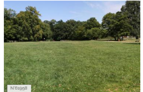
Jouy-en-Josas city - Domaine de la Cour Roland/Park