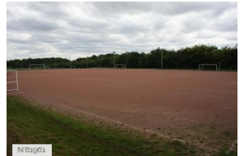
Jouy-en-Josas city - Domaine de la Cour Roland/Outdoor Fields