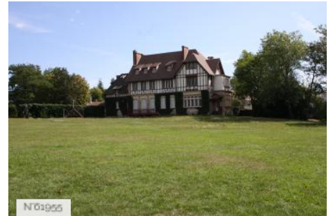
Jouy-en-Josas city - Jeanne Blum school