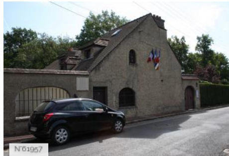
Jouy-en-Josas city - Jeanne and Léon Blum house