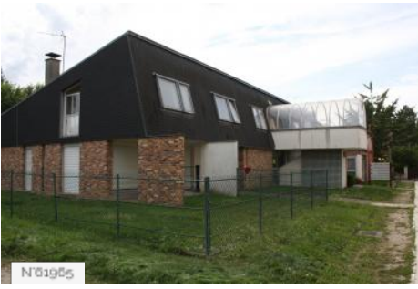
Jouy-en-Josas city - Internet center-Library