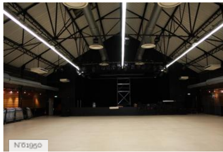
Jouy-en-Josas city - Global information