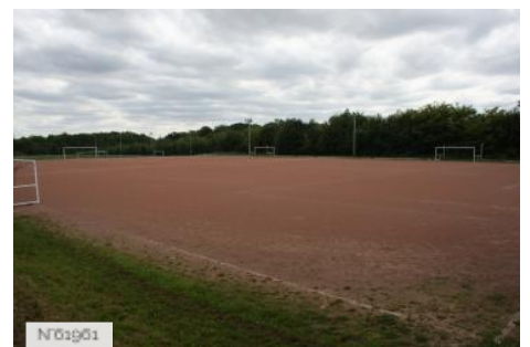
Jouy-en-Josas city - Domaine de la Cour Roland/Outdoor Fields