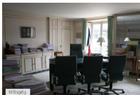
Jouy-en-Josas city - City hall/Mayor's office