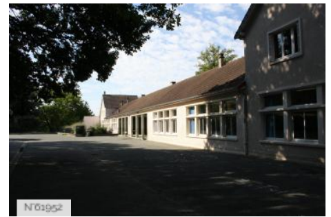
Jouy-en-Josas city - Bourget-Calmette primary school