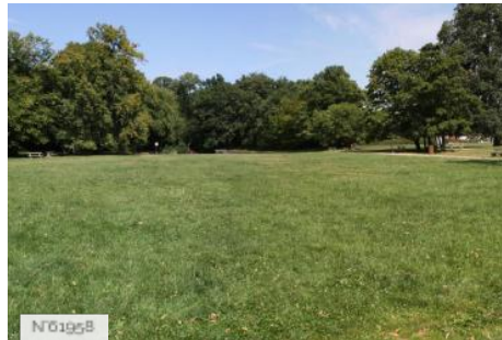
Jouy-en-Josas city - Domaine de la Cour Roland/Park