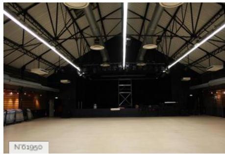
Jouy-en-Josas city - Global information