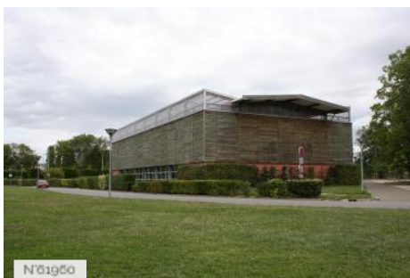
Jouy-en-Josas city - Domaine de la Cour Roland/Covered tennis courts