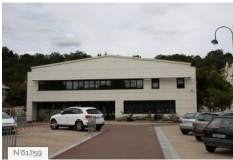
Jouy-en-Josas city - Vieux marché hall