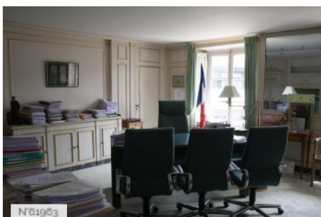
Jouy-en-Josas city - City hall/Mayor's office