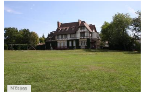
Jouy-en-Josas city - Jeanne Blum school