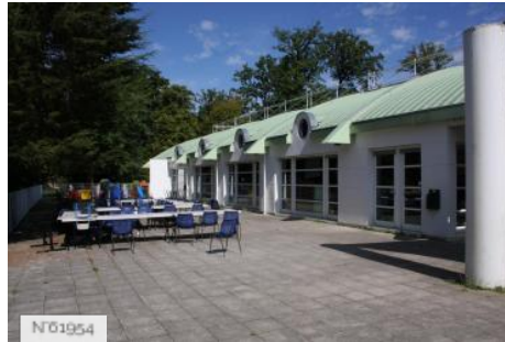
Jouy-en-Josas city - Leisure centre