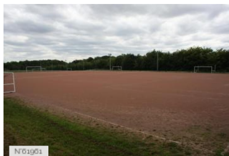
Jouy-en-Josas city - Domaine de la Cour Roland/Outdoor Fields