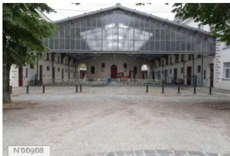
Alfort Veterinary School - Stables