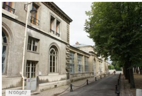
Alfort Veterinary School - Exteriors