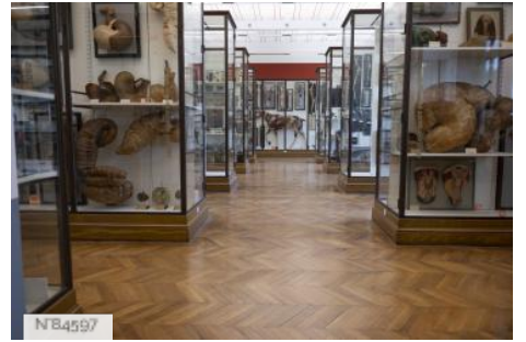
Ecole Nationale Vétérinaire d'Alfort - Fragonard Anatomy Museum