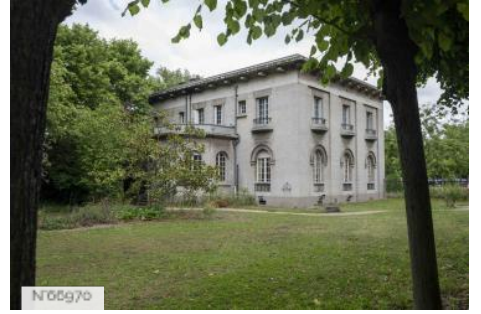
Alfort Veterinary School - Director's pavilion