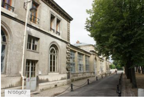
Alfort Veterinary School - Exteriors