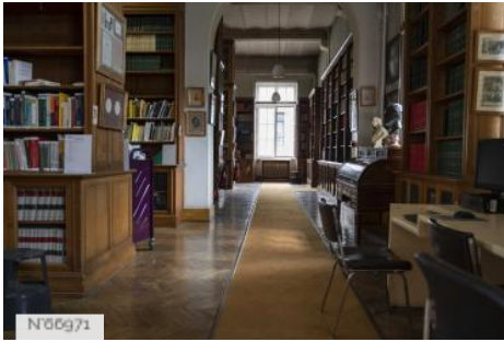
Alfort Veterinary School - Library