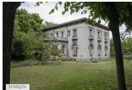
Alfort Veterinary School - Director's pavilion