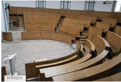
Alfort Veterinary School - Lecture theater