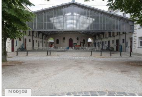
Alfort Veterinary School - Stables