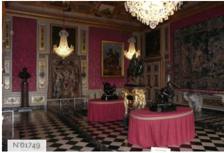
Château de Vaux-le-Vicomte - Hercules dining room