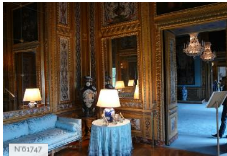
Château de Vaux-le-Vicomte - Games room