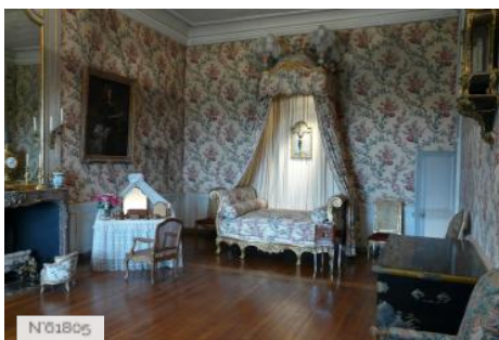
Château de Vaux-le-Vicomte - Bedroom Louis XV style