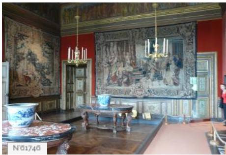
Château de Vaux-le-Vicomte - Great bedroom