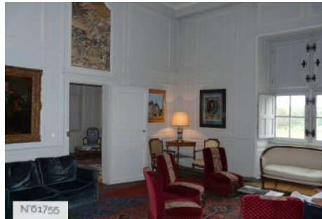
Château de Vaux-le-Vicomte - Friends of Vaux-le-Vicomte room