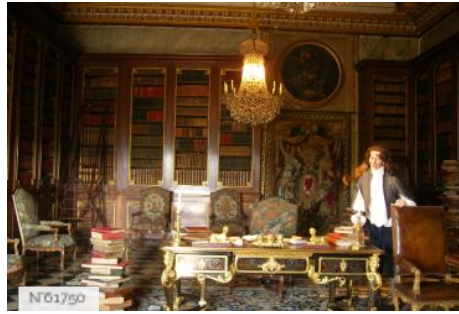
Château de Vaux-le-Vicomte - Library