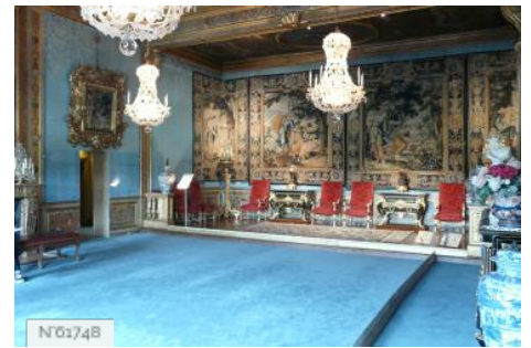
Château de Vaux-le-Vicomte - Bedroom of the Muses