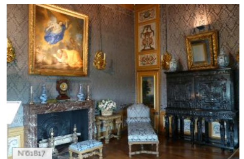
Château de Vaux-le-Vicomte - Madame Fouquet's office