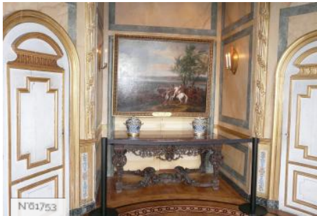
Château de Vaux-le-Vicomte - Bathroom