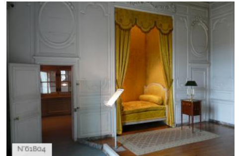
Château de Vaux-le-Vicomte - Bedroom Louis XVI style