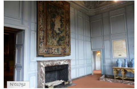
Château de Vaux-le-Vicomte - King's office