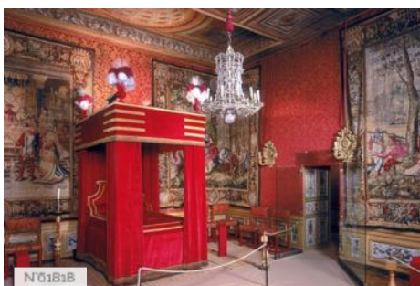
Château de Vaux-le-Vicomte - Fouquet's bedroom