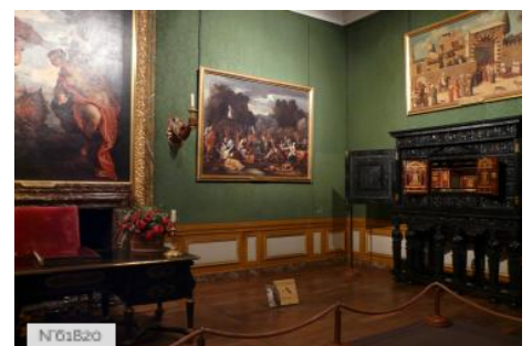
Château de Vaux-le-Vicomte - Anteroom