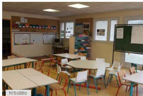
Village of Blennes - Multi-purpose hall