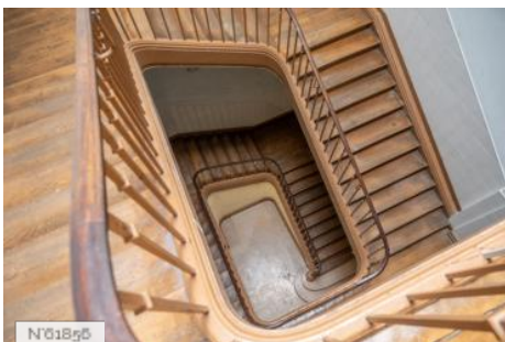
Saint Philippe Educationnal village - Staircase