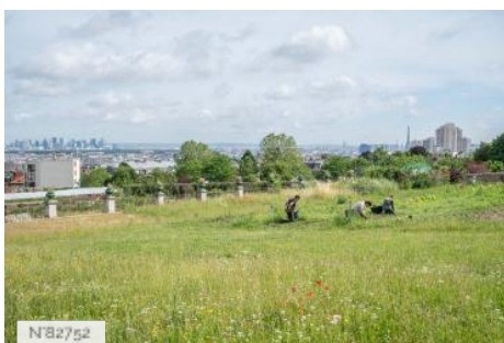
Village éducatif Saint-Philippe - Garden