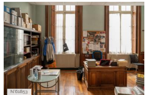
Saint Philippe Educationnal village - Cultural activities office