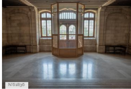
Saint Philippe Educationnal village - Chateau entrance hall