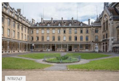
Village éducatif Saint-Philippe - Cour du prieuré