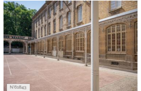
Saint Philippe Educationnal village - Courtyard with basketball hoop