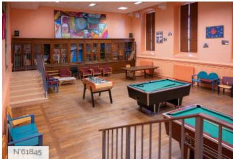
Saint Philippe Educationnal village - Rodin Hall