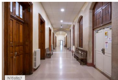
Saint Philippe Educationnal village - Corridor