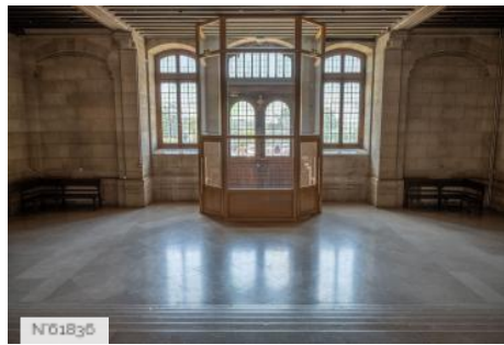
Saint Philippe Educationnal village - Chateau entrance hall