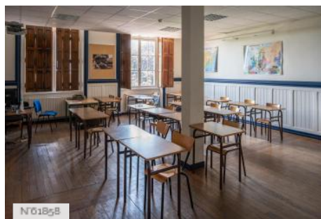
Saint Philippe Educationnal village - Classroom