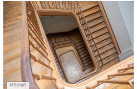
Saint Philippe Educationnal village - Staircase