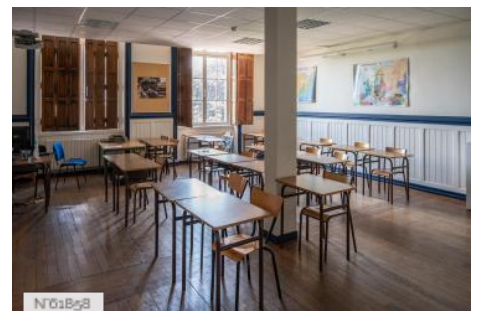
Saint Philippe Educationnal village - Classroom