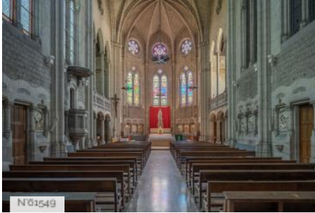
Saint Philippe Educationnal village - Chapel