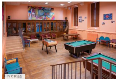
Saint Philippe Educationnal village - Rodin Hall