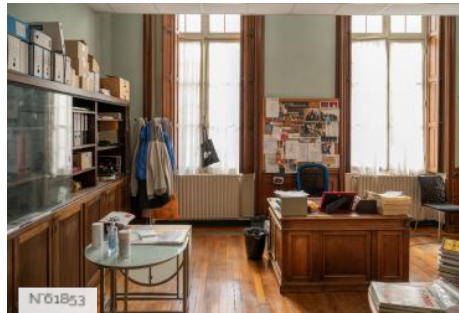
Saint Philippe Educationnal village - Cultural activities office