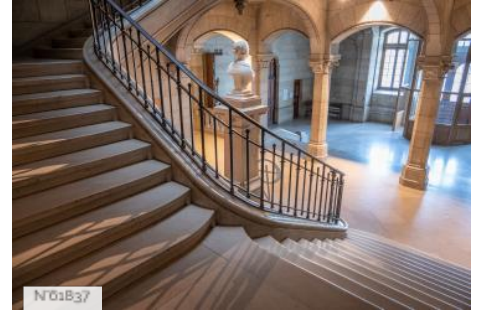
Saint Philippe Educationnal village - Staircase of honor