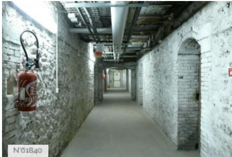
Saint Philippe Educationnal village - Cellars and undergounds