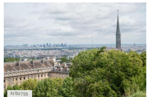
Village éducatif Saint-Philippe - Outdoors