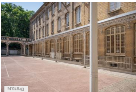
Saint Philippe Educationnal village - Courtyard with basketball hoop