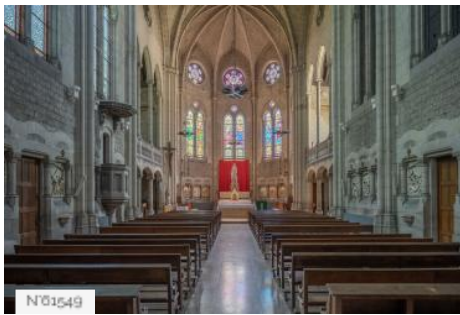
Saint Philippe Educationnal village - Chapel