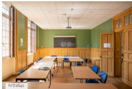
Saint Philippe Educationnal village - Jules Verne Hall