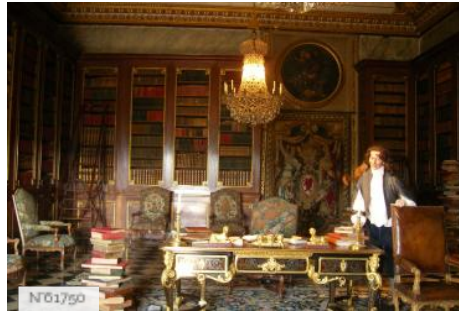
Château de Vaux-le-Vicomte - Library