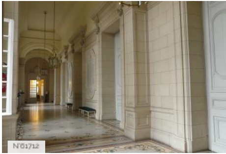
Versailles Town hall - Gallery (1st floor)