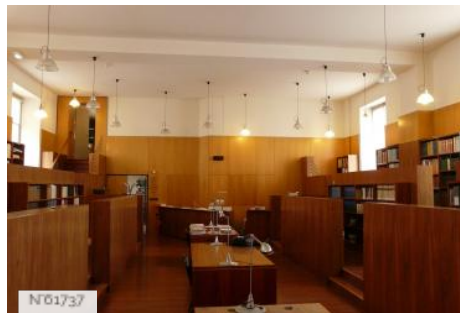
Centre for Baroque Music of Versailles - Sebastien de Brossard Library