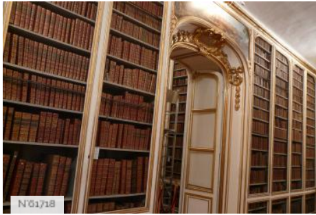
Municipal Library of Versailles