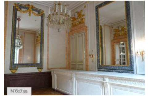
Montansier Theatre - Foyer