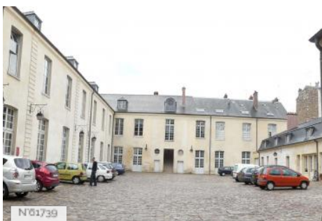
Centre for Baroque Music of Versailles - Global information