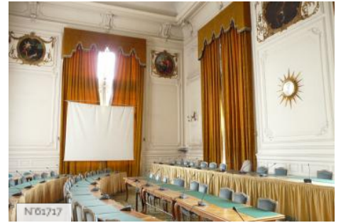
Versailles Town hall - Town council room