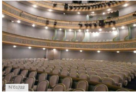
Montansier Theatre - Auditorium