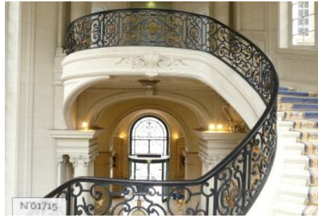
Versailles Town hall - Vestibule & Staircase