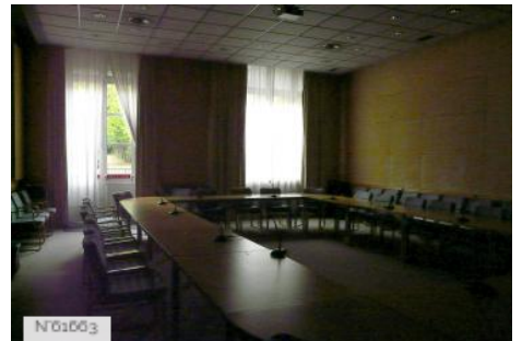
Yvelines prefecture - Paul Demange Room