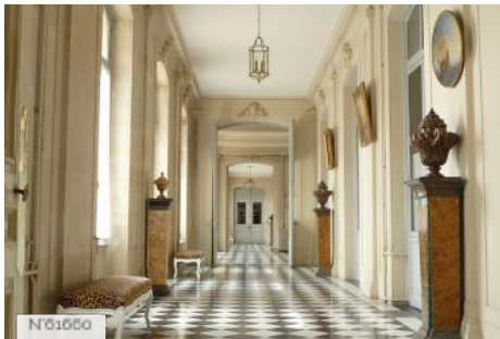
Yvelines prefecture - Gallery