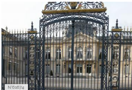
Yvelines prefecture - Courtyard of Honor and Garden