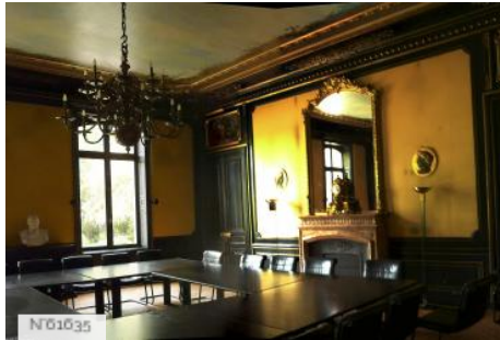
Yvelines prefecture - Thiers dining room