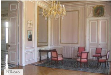
Yvelines prefecture - Claude Erignac lounge