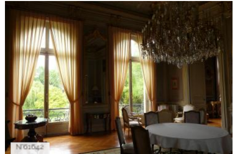
Yvelines prefecture - Empress Eugénie lounge