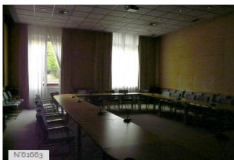
Yvelines prefecture - Paul Demange Room