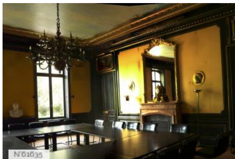
Yvelines prefecture - Thiers dining room