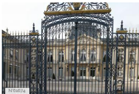
Yvelines prefecture - Courtyard of Honor and Garden