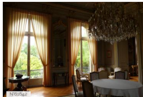
Yvelines prefecture - Empress Eugénie lounge