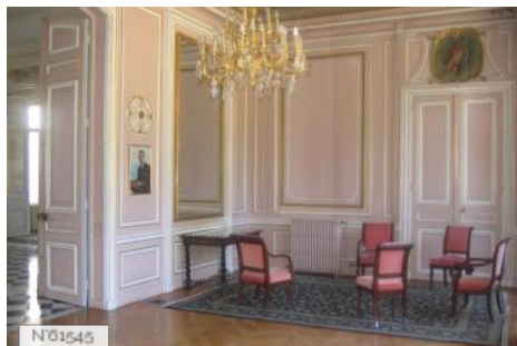
Yvelines prefecture - Claude Erignac lounge