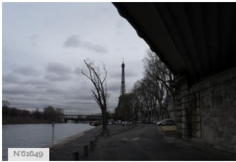
Ports de Paris - Port de Grenelle