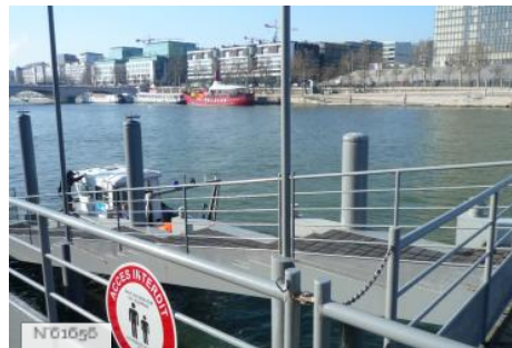
Ports de Paris - Port de Bercy Amont & Aval