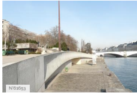
Ports de Paris - Port Saint Bernard