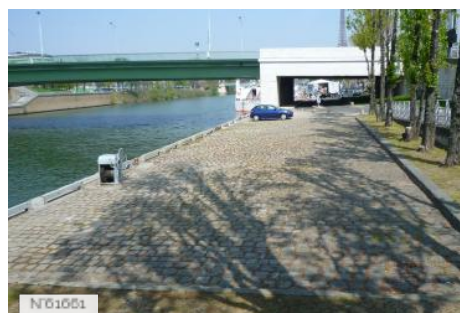
Ports de Paris - Port de Javel-Haut