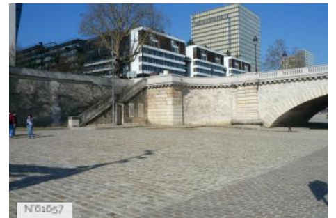
Ports de Paris - Port de Tolbiac