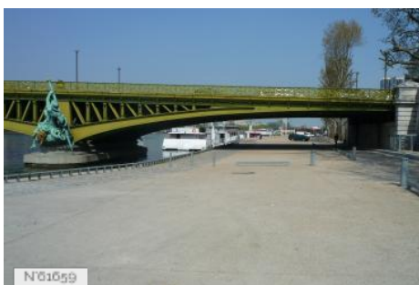
Ports de Paris - Port de Javel-Bas