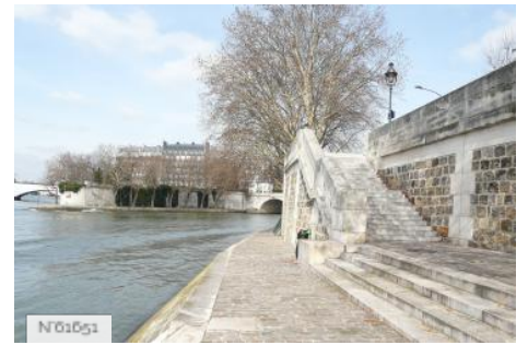
Ports de Paris - Port Henri IV