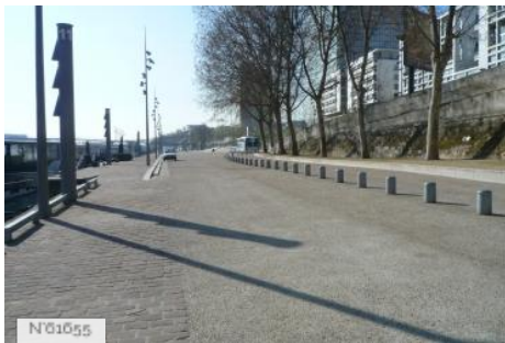
Ports de Paris - Port de la Gare