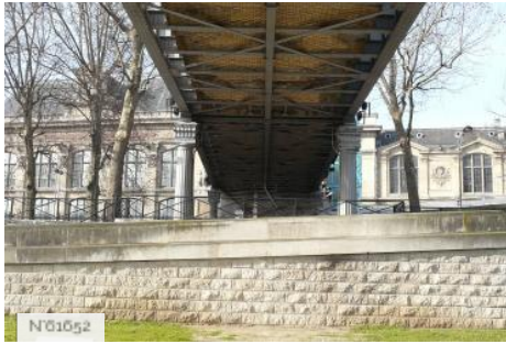
Ports de Paris - Port d'Austerlitz