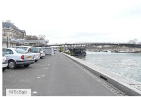
Ports de Paris - Port de Solférino