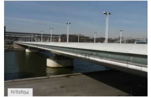
Ports de Paris - Port de la Rapée