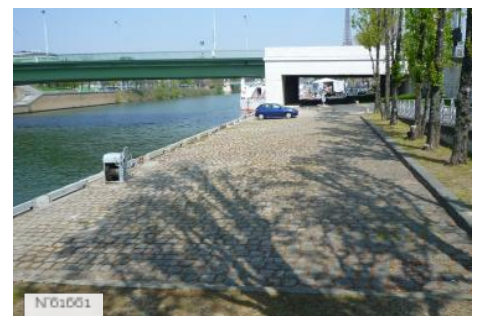
Ports de Paris - Port de Javel-Haut