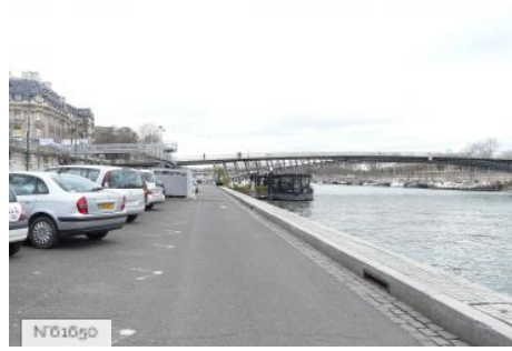
Ports de Paris - Port de Solférino