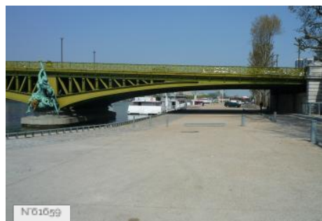
Ports de Paris - Port de Javel-Bas