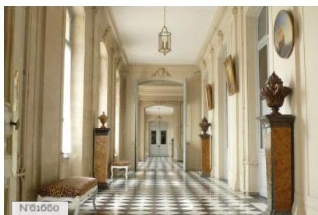
Yvelines prefecture - Gallery