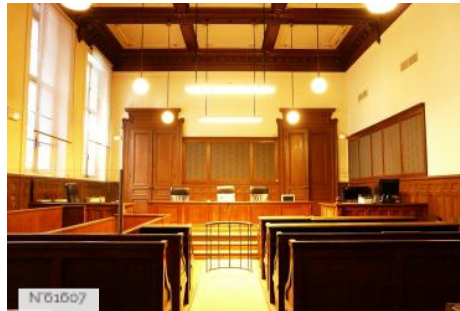
County Court of Versailles - Courtroom B