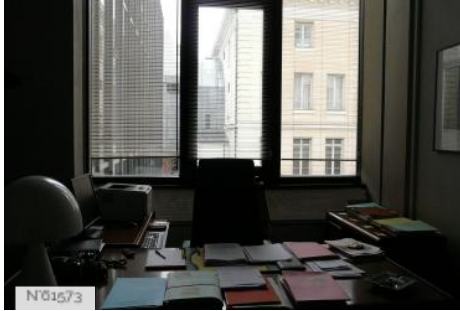
County Court of Versailles - Office of the secretary-general