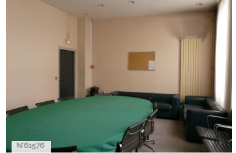
County Court of Versailles - Deliberation room