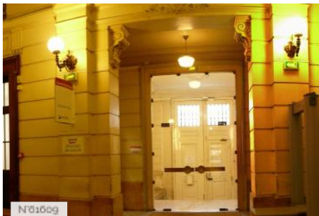
County Court of Versailles - Lobby