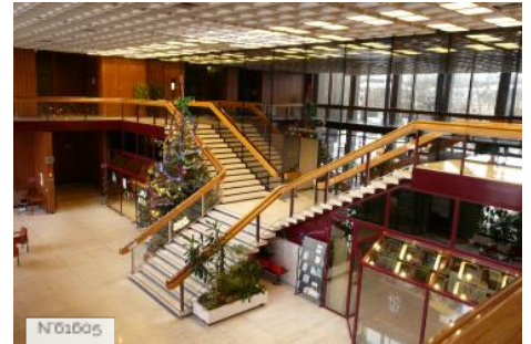
County Court of Versailles - New entrance lobby