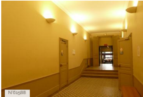
County Court of Versailles - Courtroom A