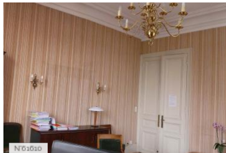
County Court of Versailles - Office of the president of the civil courtroom