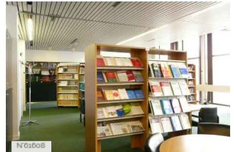
County Court of Versailles - Jacqueline Cochard library