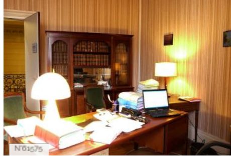
County Court of Versailles - Office of the president of the 6th chamber