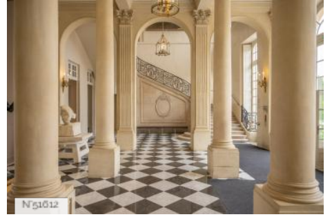
Musée Rodin - Lobby of Hotel Biron