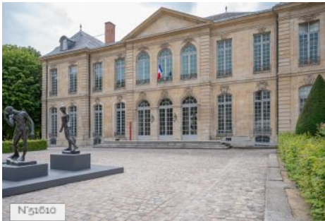
Musée Rodin - Courtyard of honor Hotel Biron