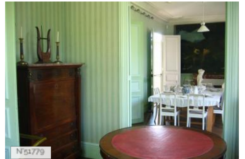
Musée Rodin de Meudon - lounge and dining room