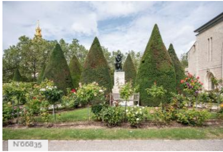
Musée Rodin - Hotel Biron rose garden