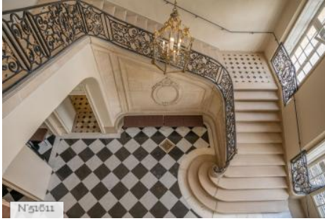
Musée Rodin - Hotel Biron staircase