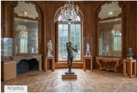
Musée Rodin - l'age d'airain room