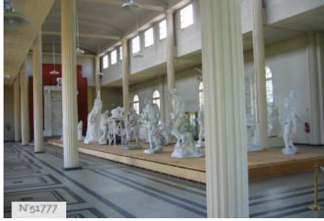
Musée Rodin de Meudon - Plaster gallery