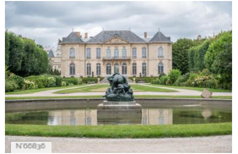
Musée Rodin - Hotel Biron: park