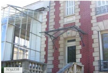
Musée Rodin de Meudon - House and park