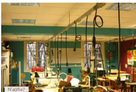
Lycée Octave Feuillet - Hats studio