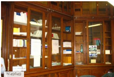
Lycée Octave Feuillet - office