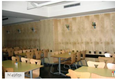
Lycée Octave Feuillet - canteen