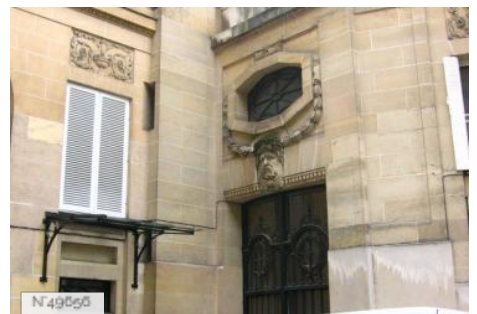
Lycée Octave Feuillet - small yard