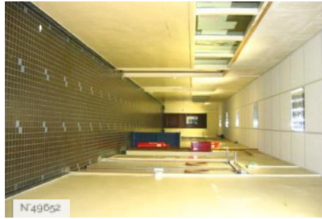
Lycée Octave Feuillet - Corridor