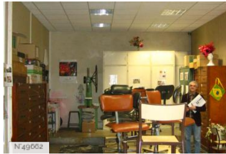
Lycée Octave Feuillet - Rectangular room