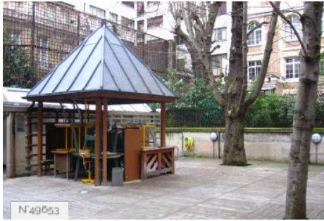
Lycée Octave Feuillet - Playground