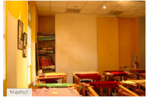
Lycée Octave Feuillet - Embroidery room