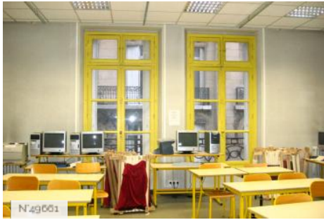
Lycée Octave Feuillet - Computers room