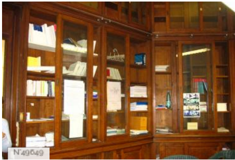
Lycée Octave Feuillet - office