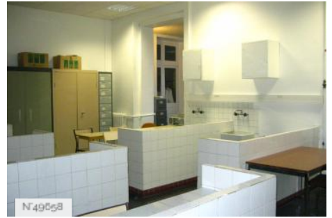
Lycée Octave Feuillet - Laboratory room