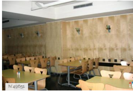
Lycée Octave Feuillet - canteen