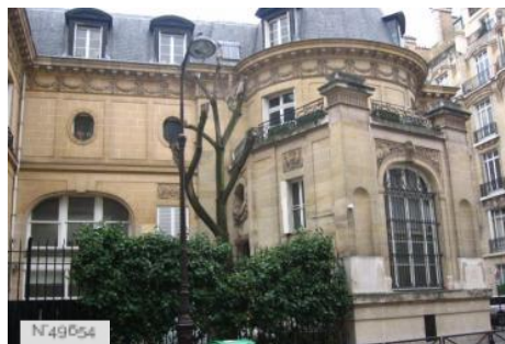
Lycée Octave Feuillet - Front