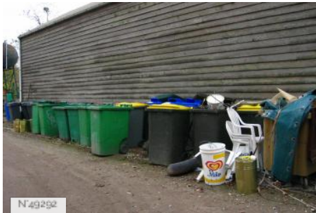
Port-aux-Cerises - rubbish dump