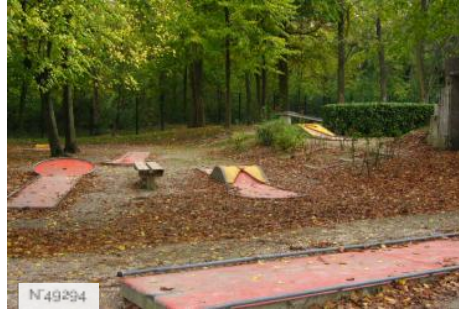
Port-aux-Cerises - crazy-golf course