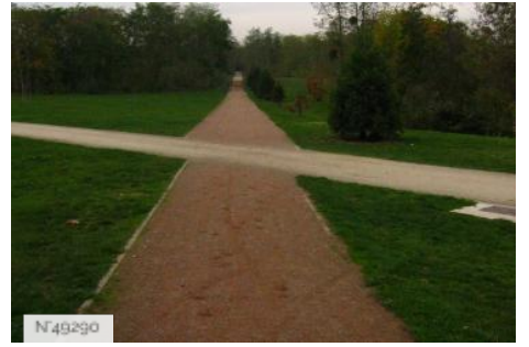
Port-aux-Cerises - Footpath