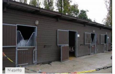
Port-aux-Cerises - Riding school