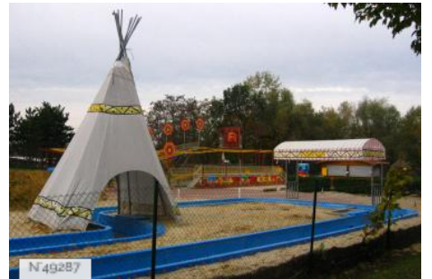
Port-aux-Cerises - playground