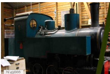
Port-aux-Cerises - Train