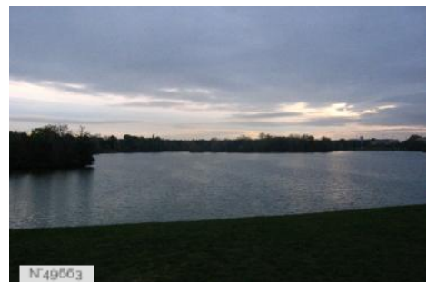
Port-aux-Cerises - beach