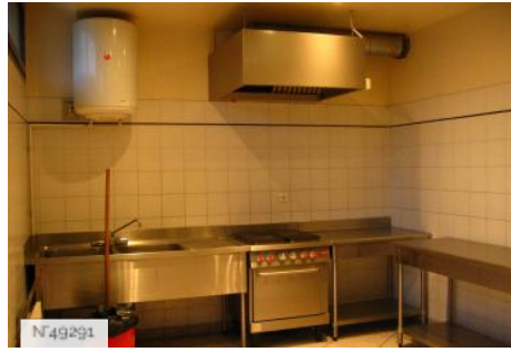
Port-aux-Cerises - kitchen