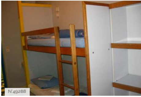
Port-aux-Cerises - youth hostel