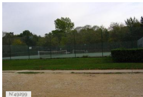
Port-aux-Cerises - Tennis court