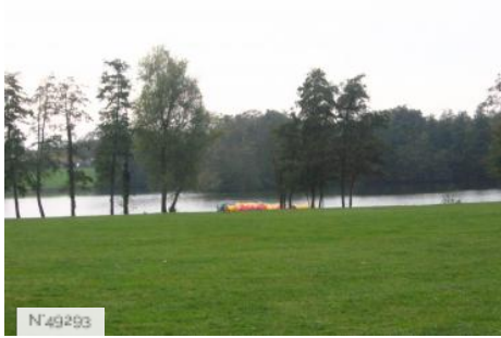
Port-aux-Cerises - ponds