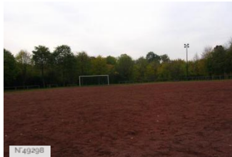
Port-aux-Cerises - Soccer field