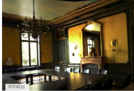
Yvelines prefecture - Thiers dining room