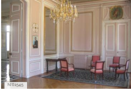
Yvelines prefecture - Claude Erignac lounge