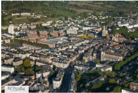
Communauté d'Agglomération Lisieux Normandie