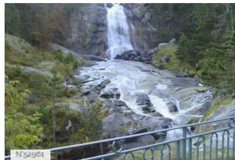
Pont d'Espagne waterfall - Cauterets