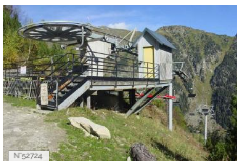
Chairlift of Gaube - Cauterets