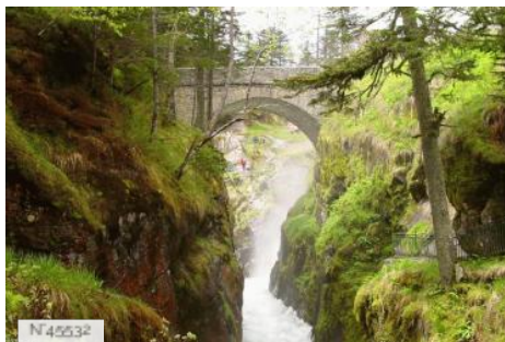
Pont d'Espagne - Cauterets