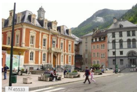
Town of Cauterets