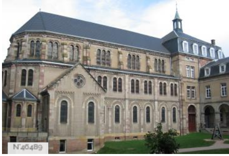
Episcopal chapel - Zillisheim