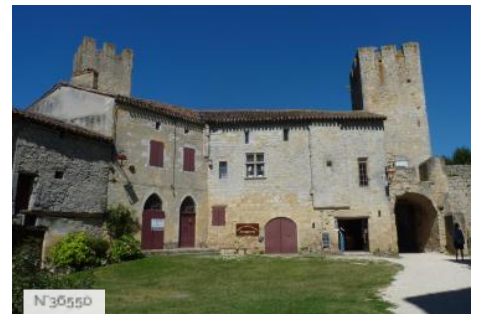
Gate of Larressingle