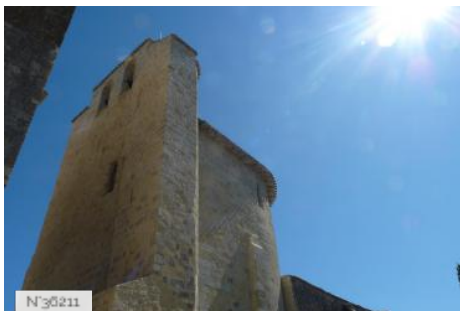
Church Saint Sigismund of Larressingle